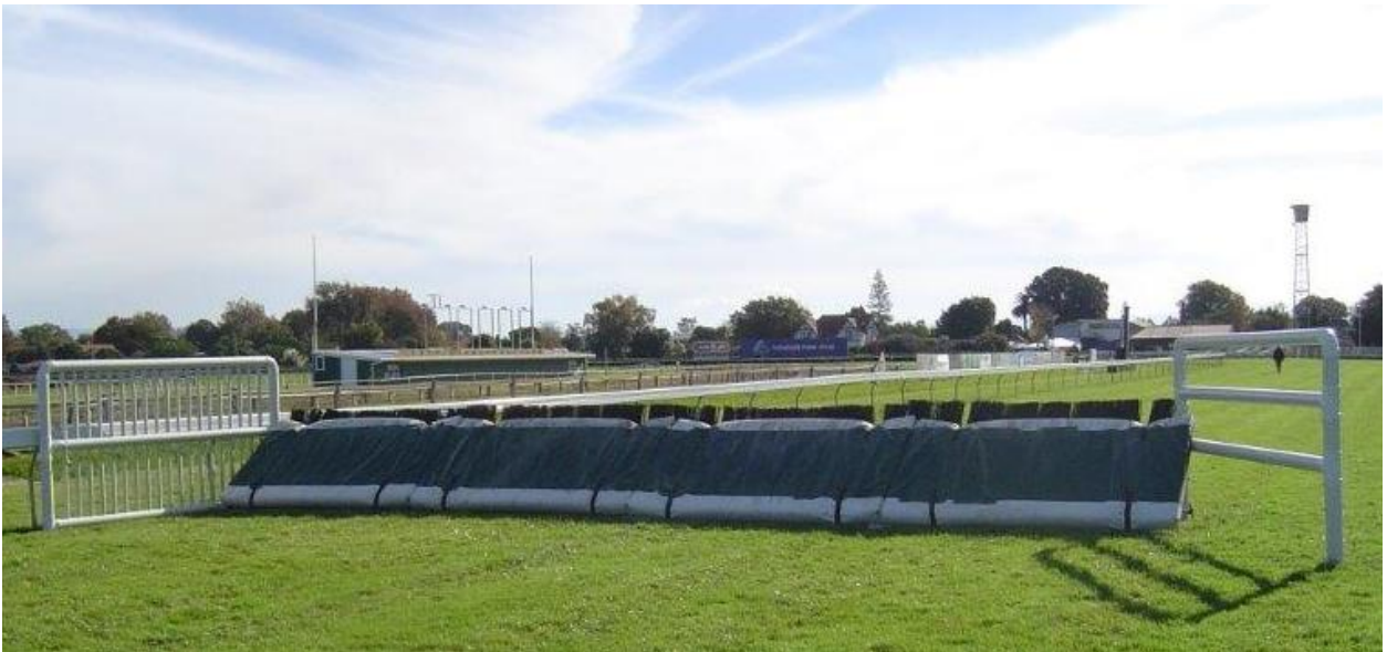
Removable Hurdle Fence – Rear Aspect