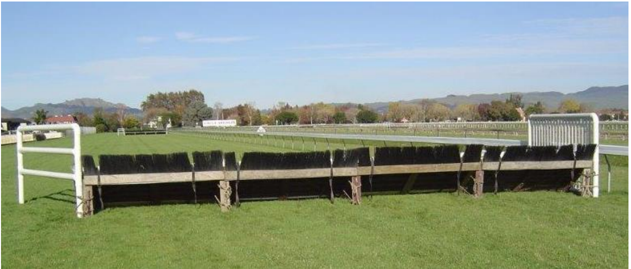
Removable Hurdle Fence – Side Aspect