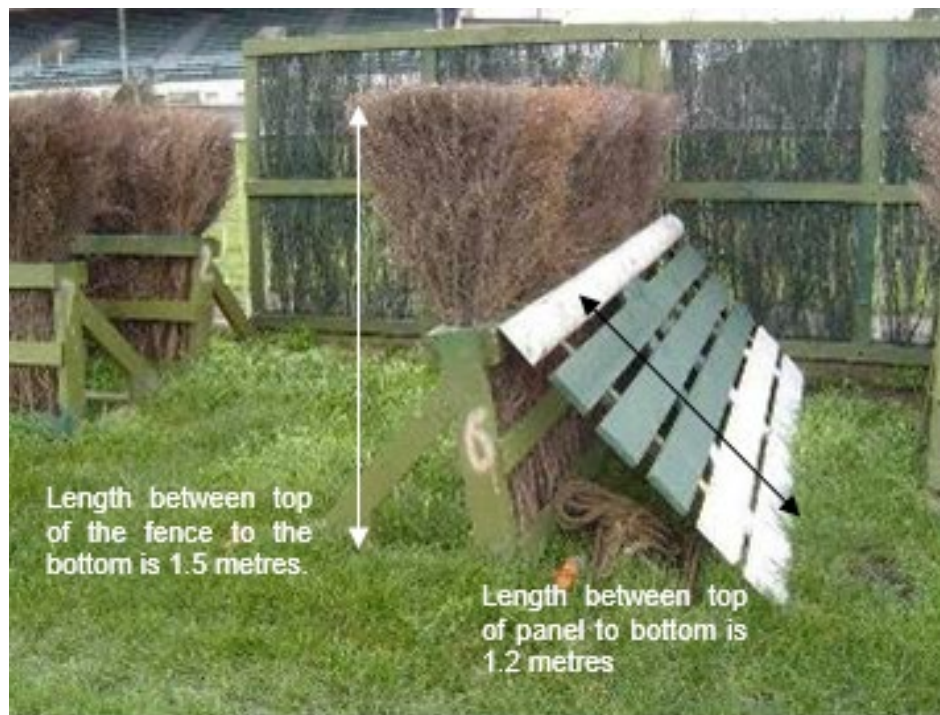
Side on view of removable Steeplechase fence