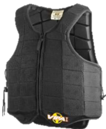
Standard: EN13158:2018 Level 1