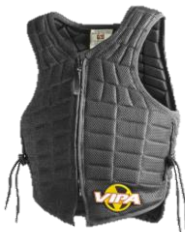
Standard: EN13158:2018 Level 1