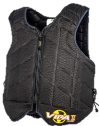
Standard: EN13158:2018 Level 2