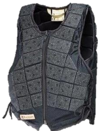
Standard: EN13158:2000 Level 1