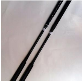
McKey Slick Stick